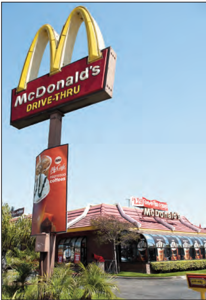
The McDonald's at 2707 E. Carson St. in Lakewood is one of the 800 stores overseen by the McDonald's Southern California Regional Office in Long Beach.

that McDonald's is the cause of obesity. The truth, which he calls a "well-kept secret," is that McDonald's offers quality, healthy food.